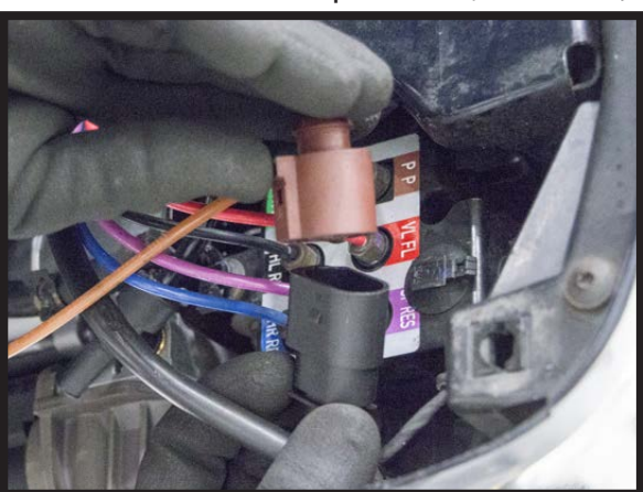
FIGURE G REV 1 03/03/2015